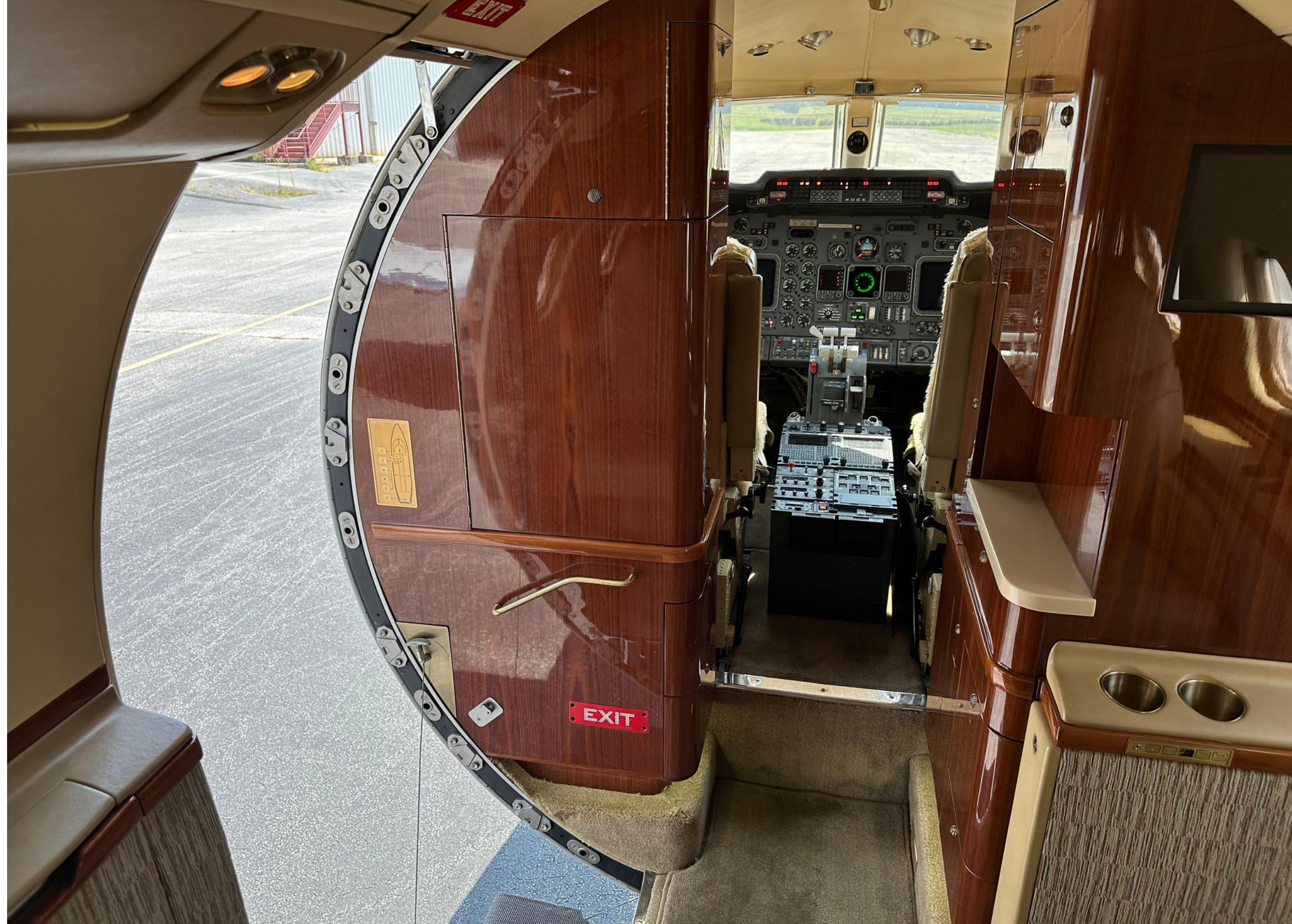
1994 LEARJET 60