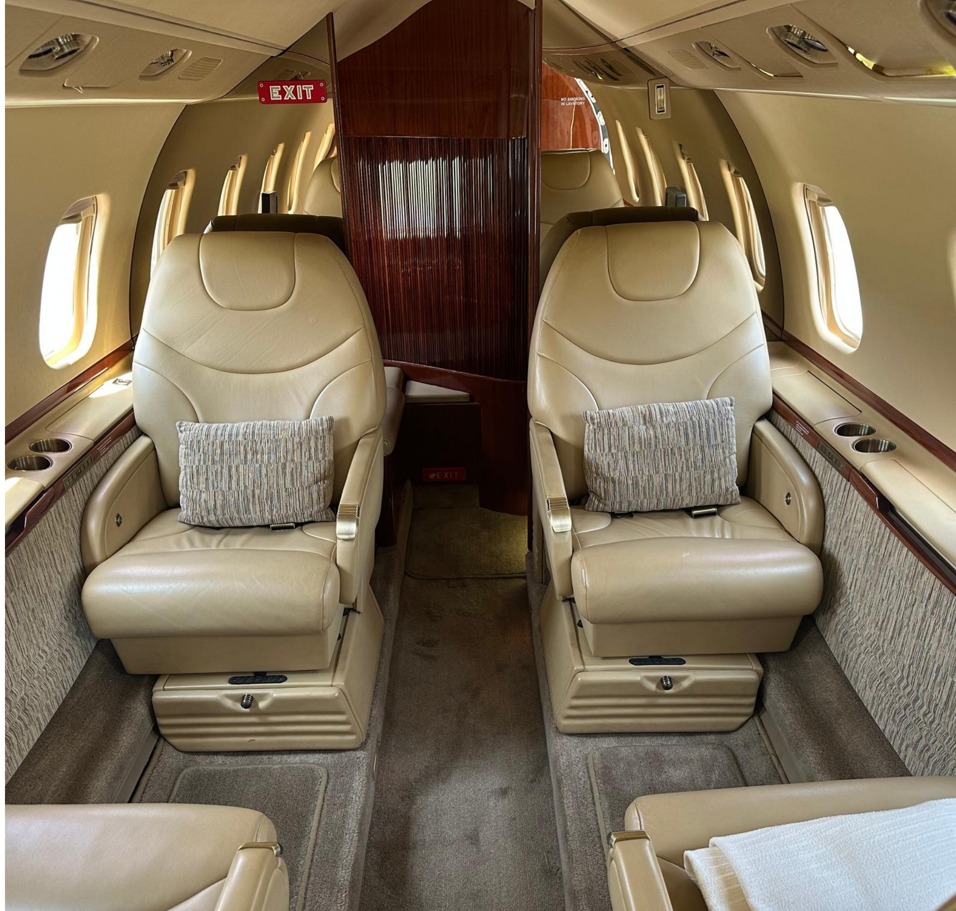
1994 LEARJET 60