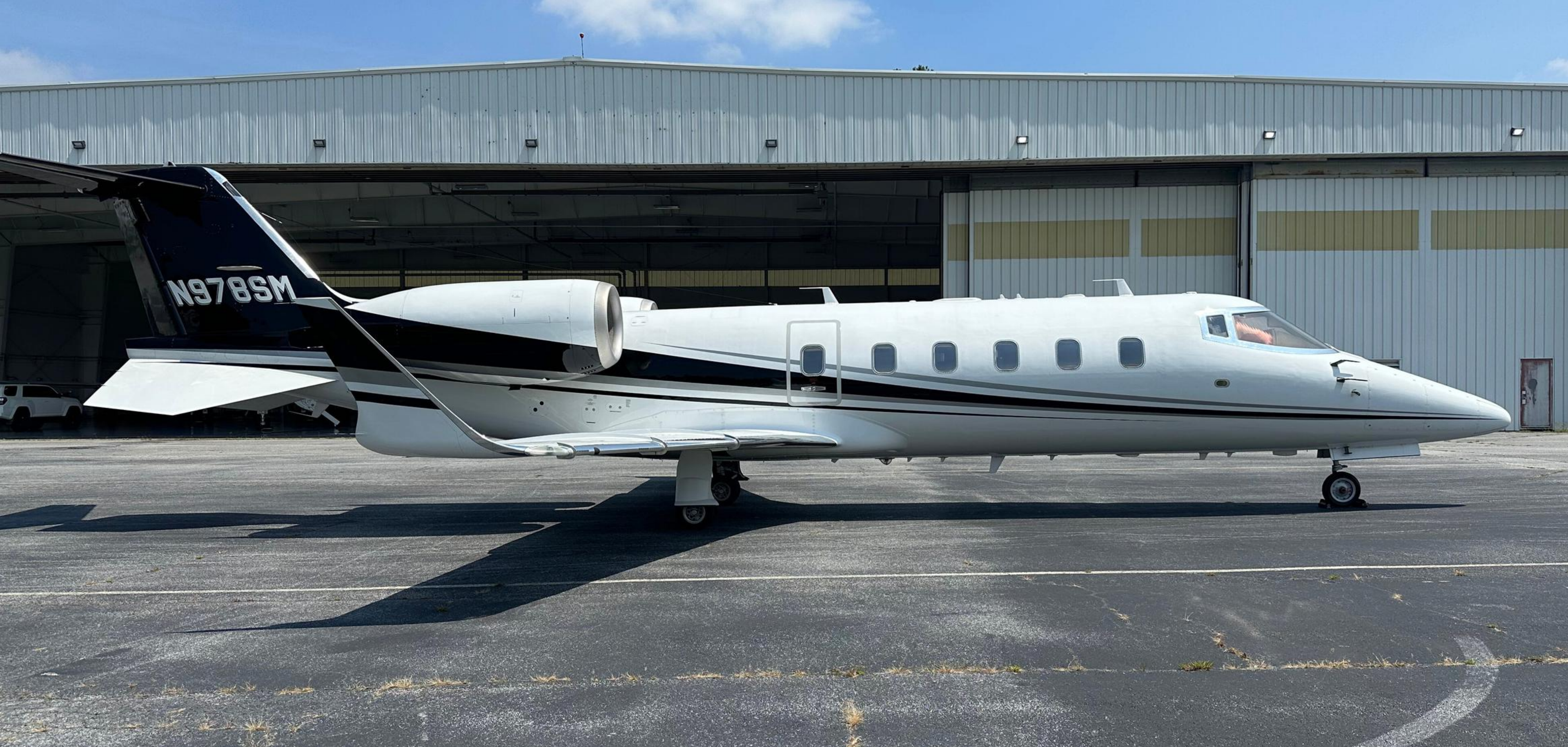
1994 LEARJET 60