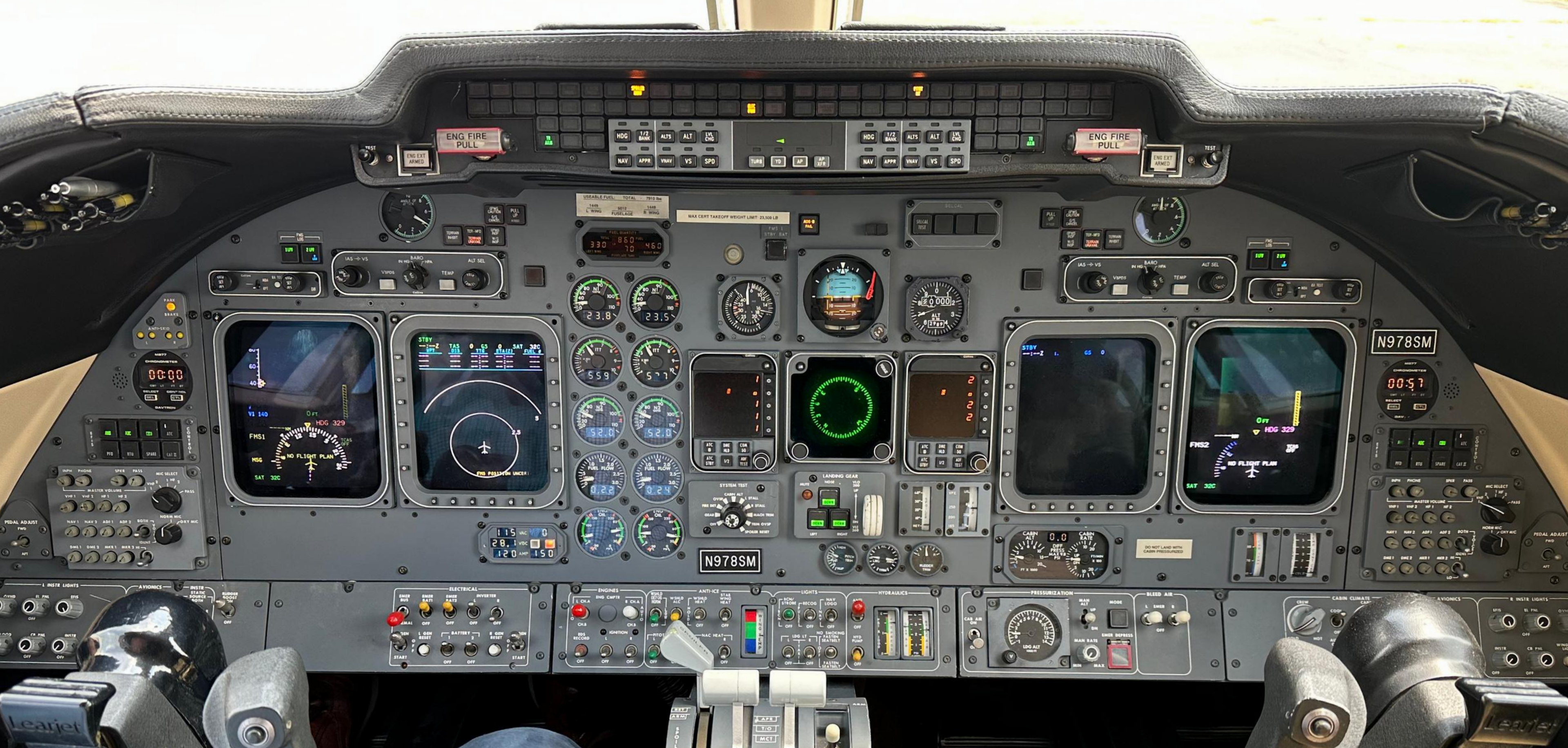
1994 LEARJET 60