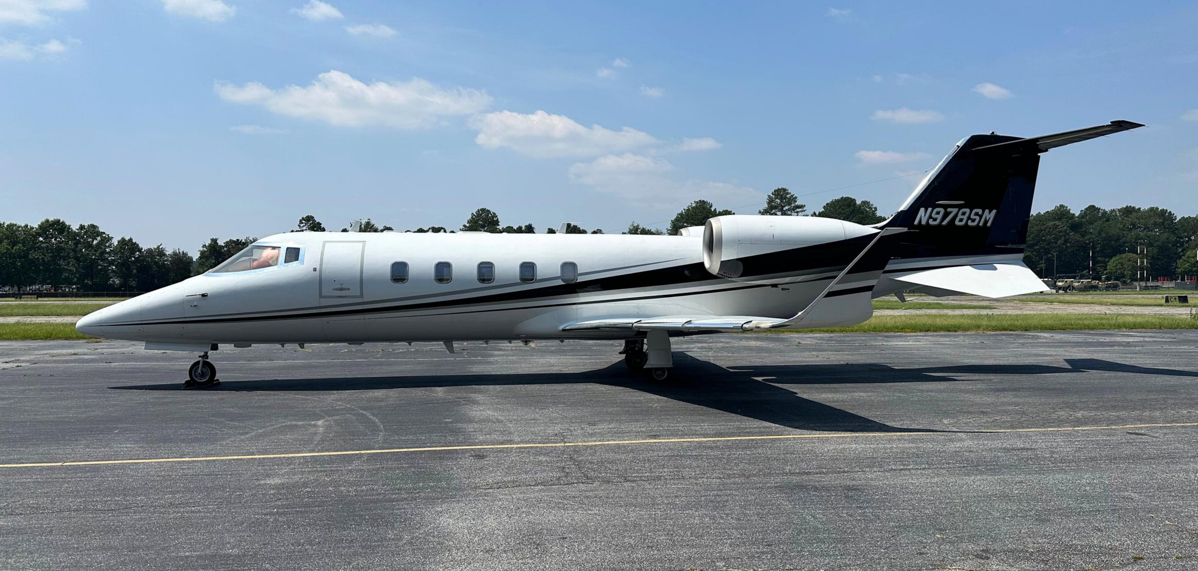
1994 LEARJET 60